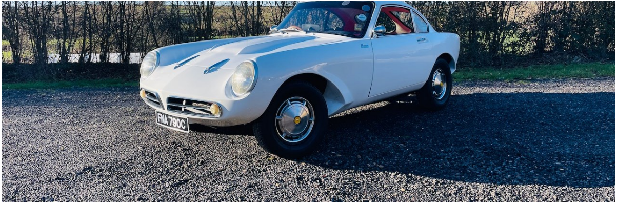
GSM Flamingo 1964